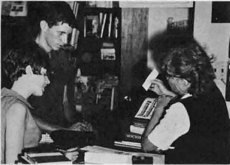
Sock it to me! Sock it to me!