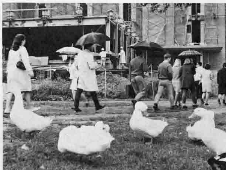
Rain on the first day of school may have dampened the spirits of umbrella-carrying students, but the steady downpour did not bother the ducks resting near the Life Sciences building under construction.